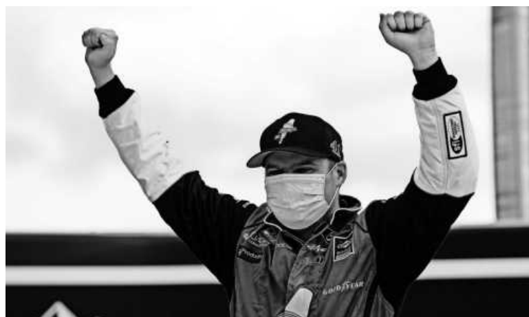
Cole Custer raced into victory lane at Kentucky Speedway to earn a playoff spot.